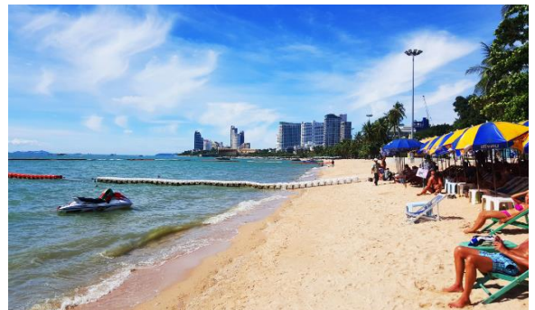
Pattaya Beach, near our office