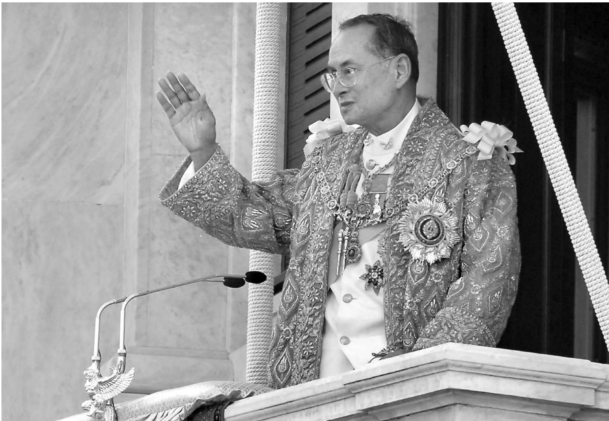
The King waves to a crowd of hundreds of thousands gathered at the Royal Plaza on June 9, 2006 to celebrate his 60th anniversary on the throne.