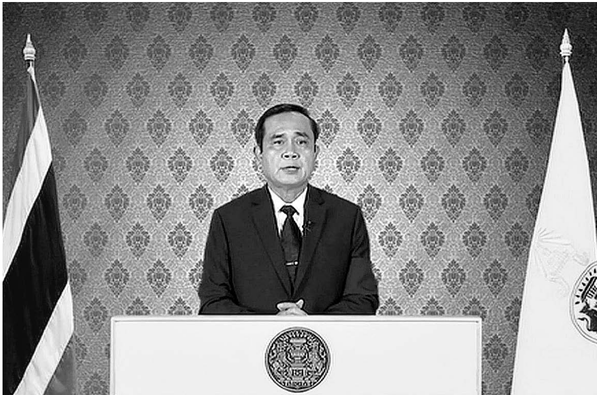
Prime Minister Prayut Chan-o-cha speaks to the nation in a televised address last night. The government has called on people to wear mourning colours for a year and has ordered government offices and educational institutes to fly the national flag at half-mast for 30 days.

Thais had been closely following news about His Majesty's illness and medical treatment at Siriraj Hospital, Prayut said, adding that whenever the beloved monarch felt well enough, he con-