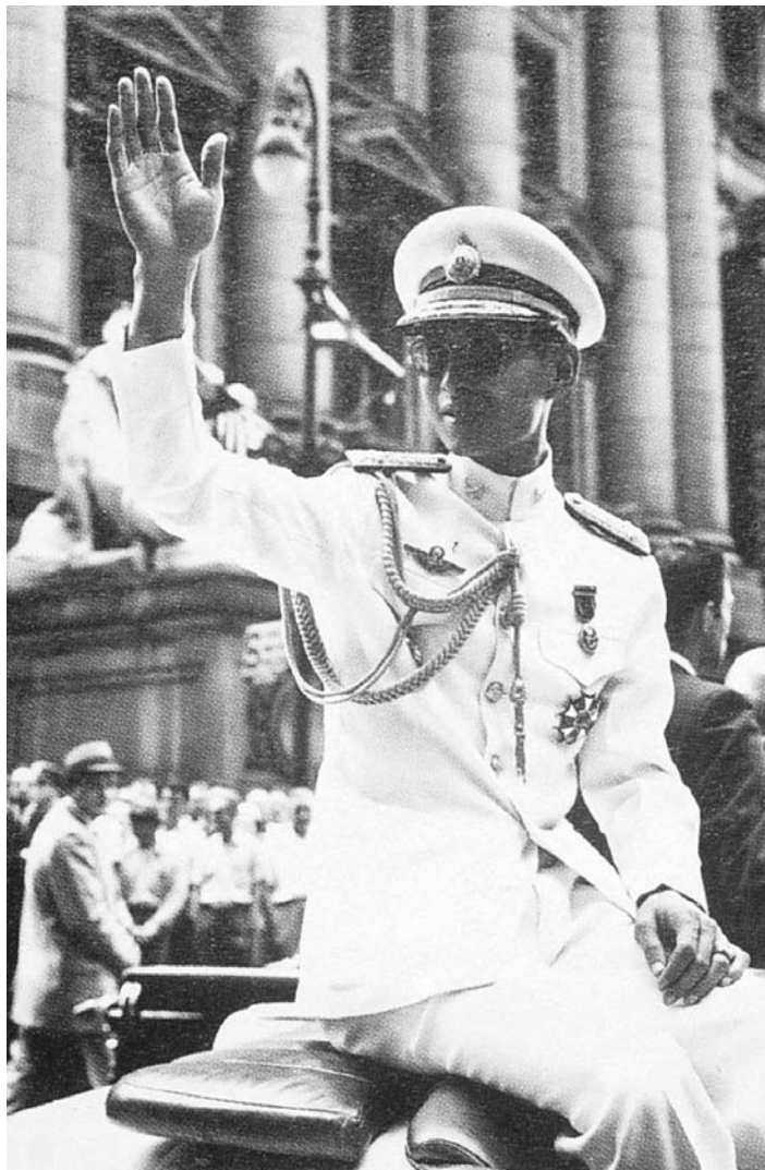
His Majesty the King waves to people during his visit to the United States in 1960.