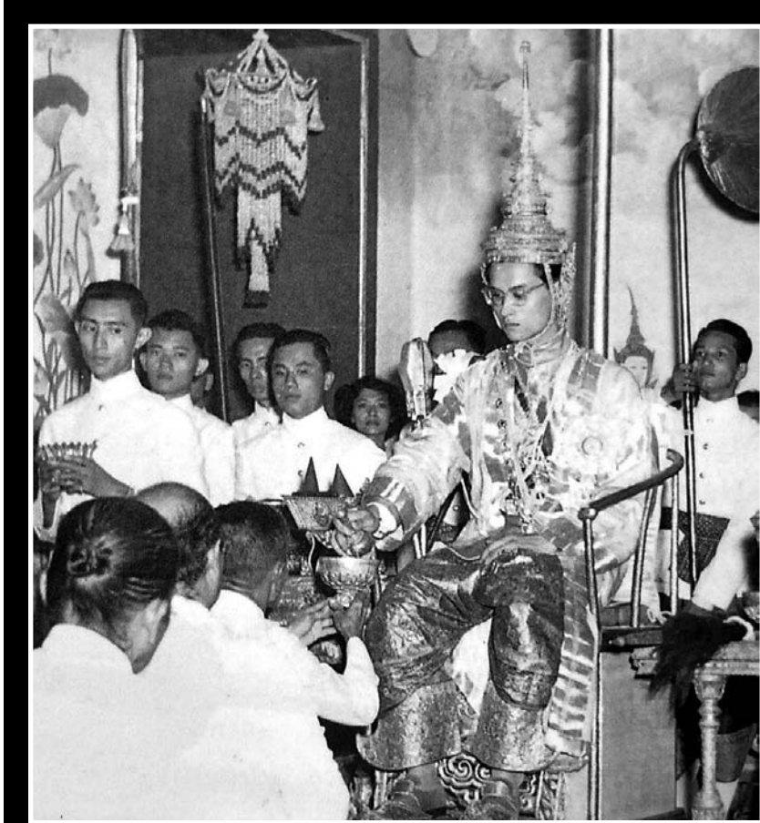
His Majesty is crowned King at the coronation ceremony in May, 1950.

before his significance to the Thai people – he was their inspiration, their leading light, and the King of their hearts.