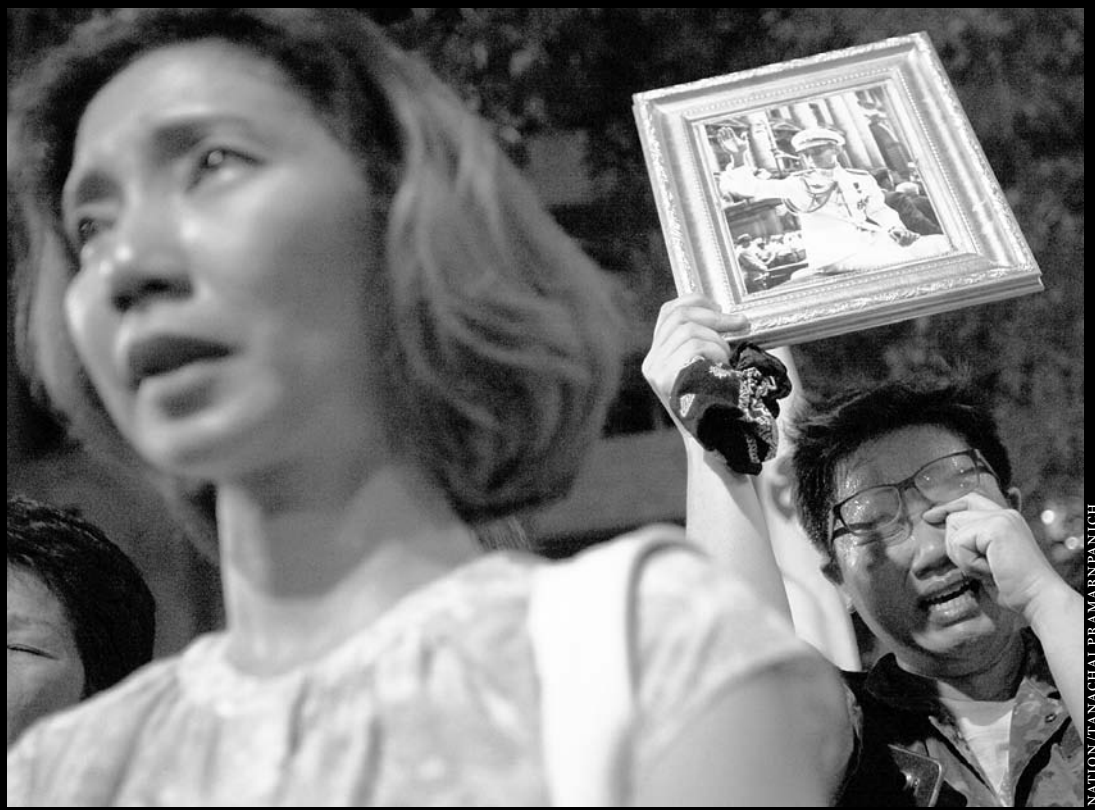
Loyal subjects holding portraits of His Majesty the King burst into tears outside Siriraj Hospital in Bangkok after hearing the news of the monarch's passing yesterday.