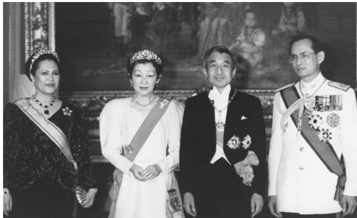
Japanese Emperor Akihito, second right, and Empress Michiko, second left, pose with Their Majesties the King and the Queen at the Grand Palace in 1991.