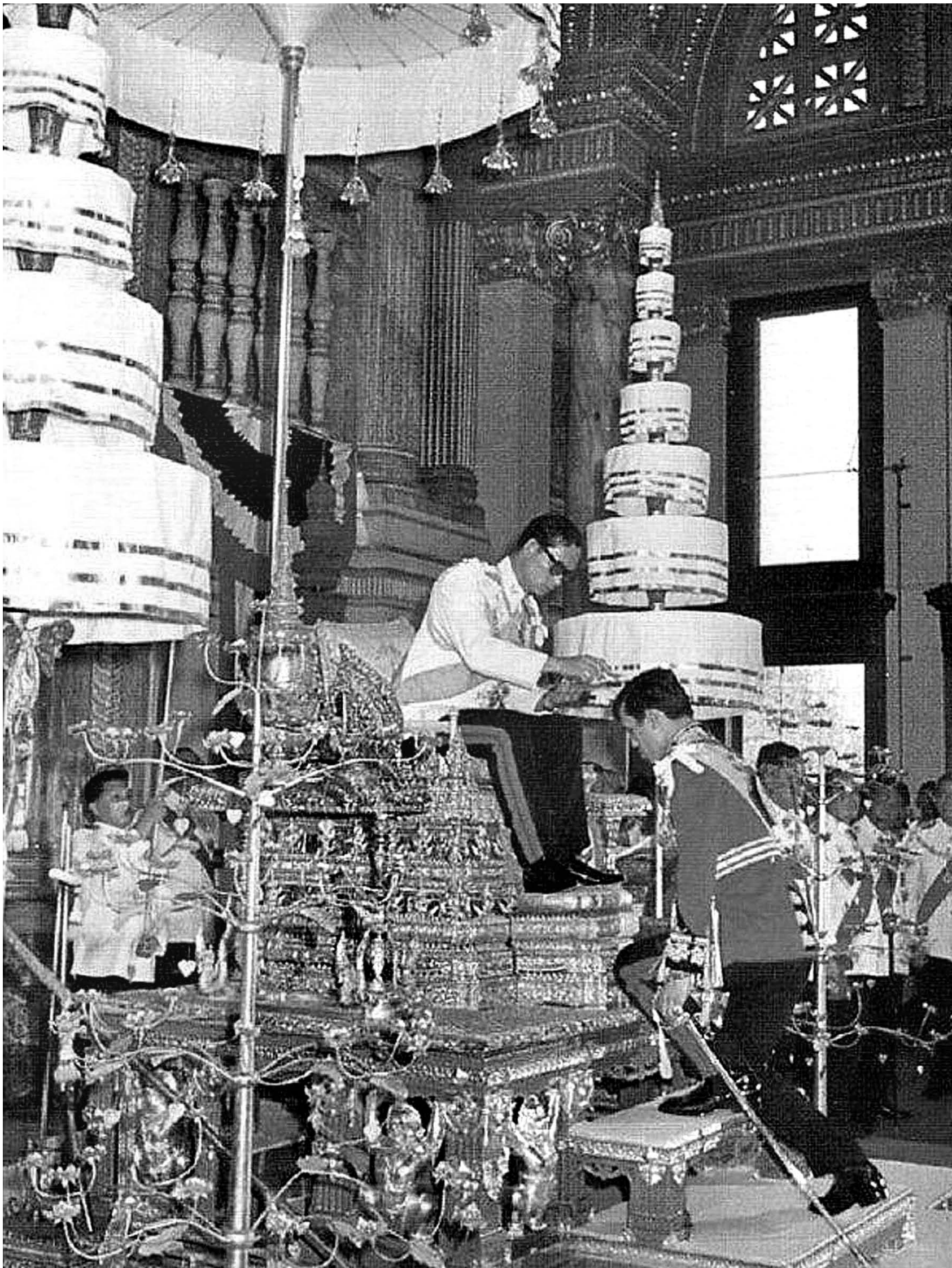
His Majesty the King bestows the title of Crown Prince on then-Prince Vajiralongkorn in a ceremony at the Ananta Samakhom Throne Hall in December 1972.

CROWN PRINCE PREFERS TO OBSERVE PERIOD OF NATIONAL MOURNING BEFORE TAKING THRONE AT 'PROPER TIME'