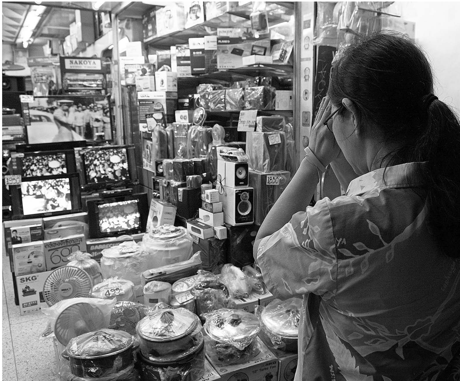
A woman pays her respects in front of a shop while televisions inside broadcast stories of HM the King who passed away yesterday.

In Chiang Mai, people had followed reports on the King's health in major venues including the busy markets via TV, before falling into silence upon