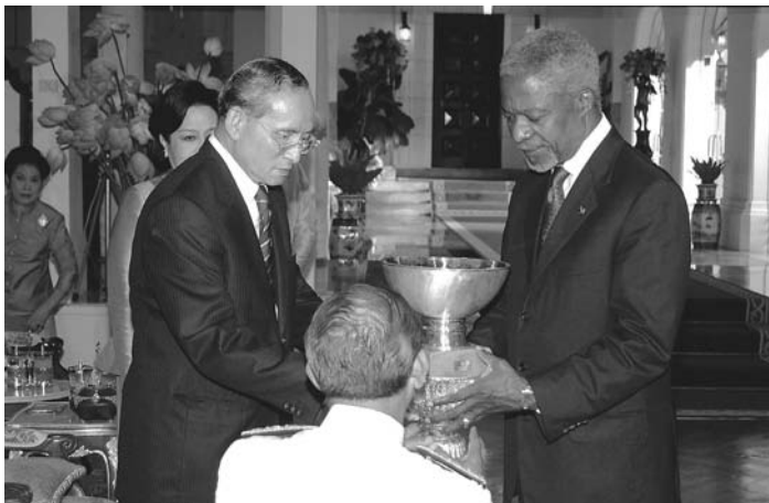
The then-UN chief Kofi Annan presents His Majesty the King with the first United Nations Human Development Lifetime Achievement Award in 2006.