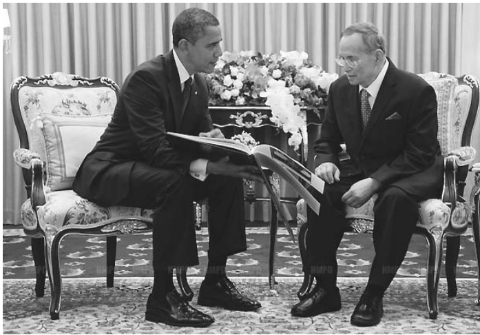
US President Barack Obama speaks with His Majesty during a royal audience granted in Siriraj Hospital in 2012.