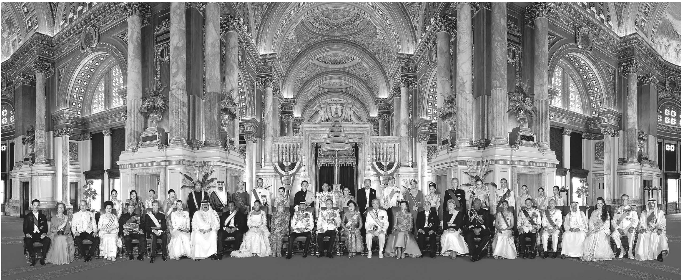
Their Majesties the King and the Queen pose with royals from across the world during the 60th anniversary of His Majesty's accession to the throne in 2014.