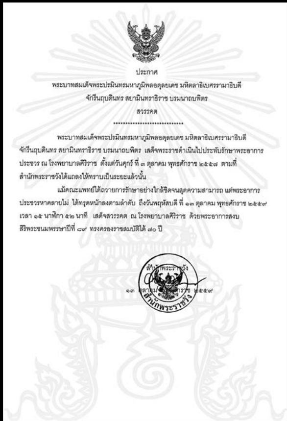
The Royal Household Bureau yesterday announced HM King Bhumibol Adulyadej's passing.