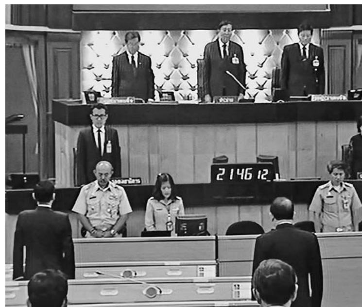
National Legislative Assembly President Pongpetch Wichicholchai calls for a special meeting at 9pm to acknowledge the Bureau of the Royal Household's announcement of His Majesty the King's passing.

"He was also extremely patient, not giving things up eas-