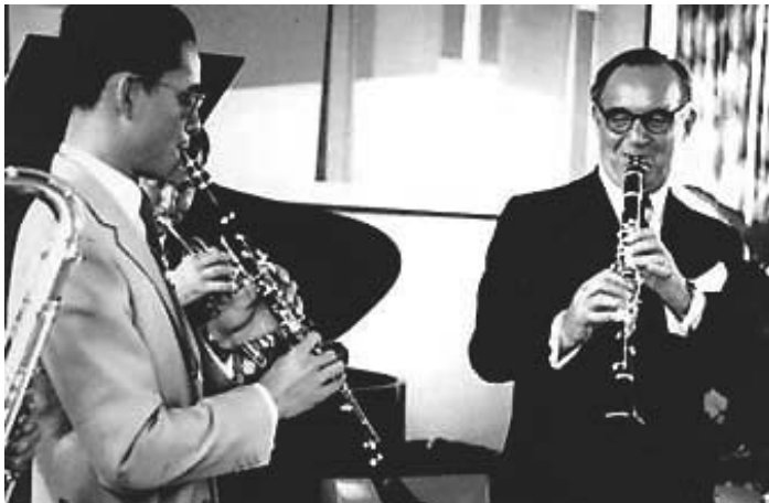
His Majesty the King plays the saxophone in a jam session with clarinetist Benny Goodman in 1960.